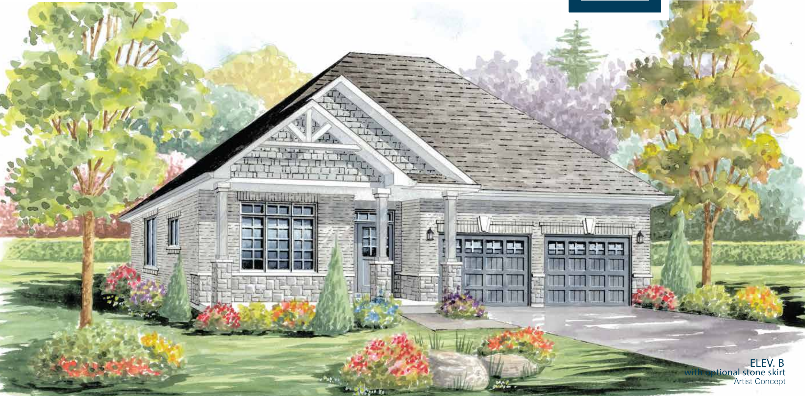
ELEV. B with optional stone skirt Artist Concept