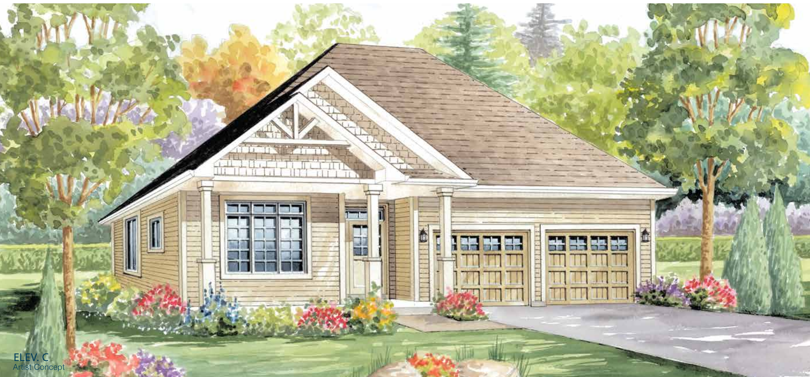
ELEV. C Artist Concept